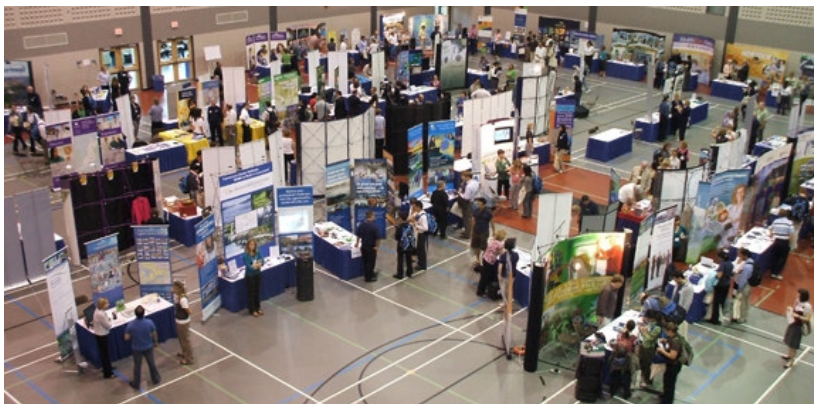
David Braley Athletic Centre Exhibition Space